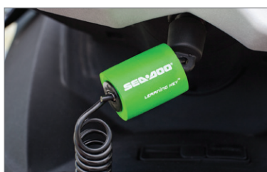
iControl™ programmable Learning Key™