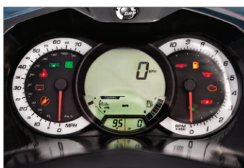
Digital information center with speedometer