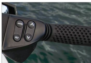
iTC™ including Touring / Sport mode