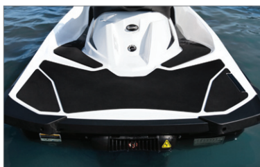
Large swim platform